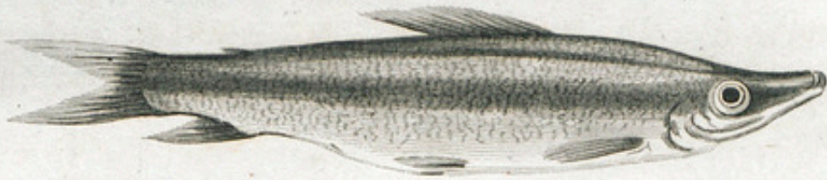
The Fresh-water Fish called Dago Fish.